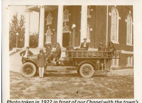
Photo taken in 1922 in front of our Chapel with the town's new firetruck

On Heritage Sunday, May 22, 2022 during the Sunday School hour everyone is invited to join us for a morning of fellowship and celebration as we come together and celebrate the history of Main Street and the 100th anniversary of the our Chapel Hall.